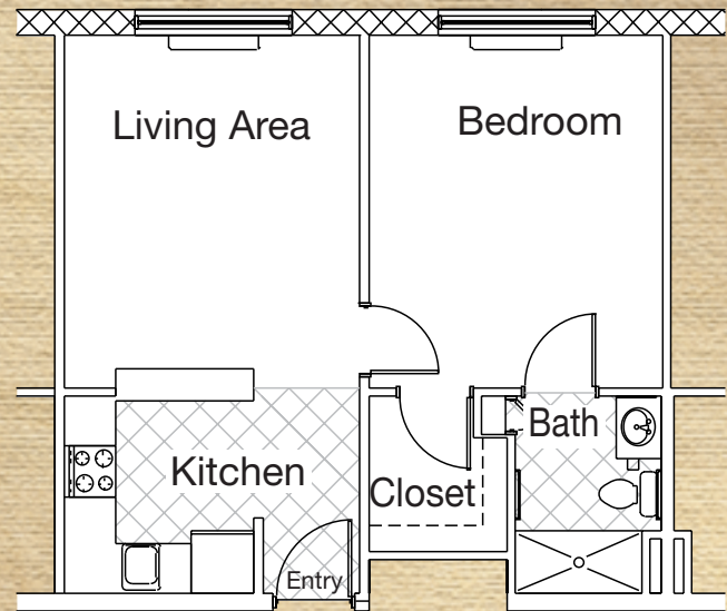
ONE BEDROOM 552 sq. ft